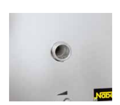
Observation hole in the door as additional equipment