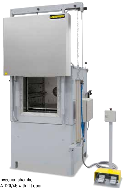
Forced convection chamber furnace NA 120/46 with lift door

These chamber furnaces with air circulation are characterized by their extremely high temperature uniformity. Hence, they are especially suitable for processes such as cooling, crystalizing, preheating, curing, but also for numerous processes in tool making. Due to the modular concept, the forced convection furnaces can be adjusted to the process requirements by adding suitable equipment.