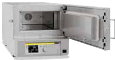
Forced convection chamber furnace NA 15/65 as table-top model

These chamber furnaces with air circulation are characterized by their extremely high temperature uniformity. Hence, they are especially suitable for processes such as cooling, crystalizing, preheating, curing, but also for numerous processes in tool making. Due to the modular concept, the forced convection furnaces can be adjusted to the process requirements by adding suitable equipment.