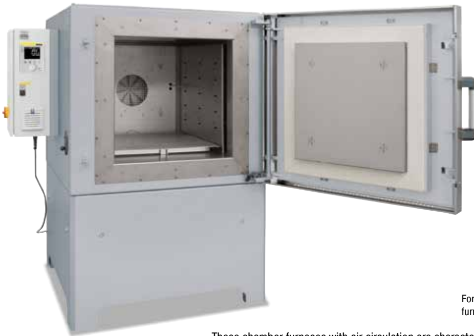
Forced convection chamber furnace NA 250/45