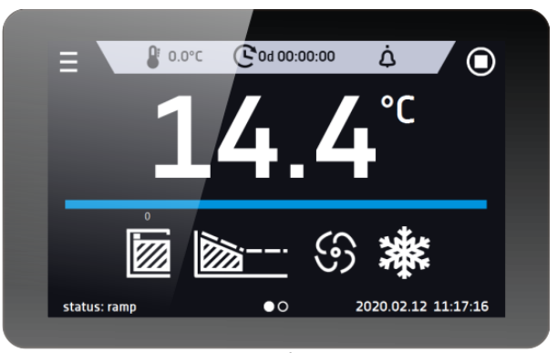
Smart - preview screen